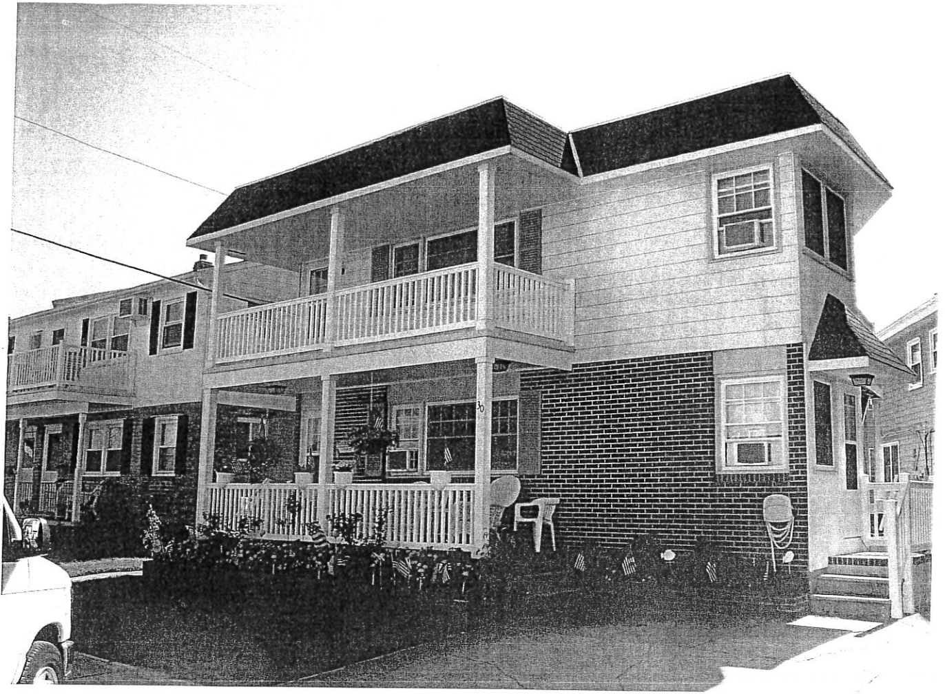
30 NORTH TWENTY-EIGHTH AVENUE LONGPORT, NEW JERSEY